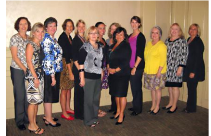
EWI Board Members 2012-2013

Just a glimpse of the 2012-2013 EWI Induction